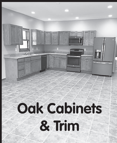
Oak Cabinets & Trim

FRI., SEPT. 2 • 4-6PM & SAT., SEPT. 3 • 1-3PM 130 11TH STREET NORTH, HUMBOLDT